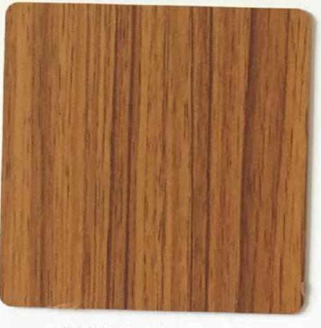
7020 Natural Teak