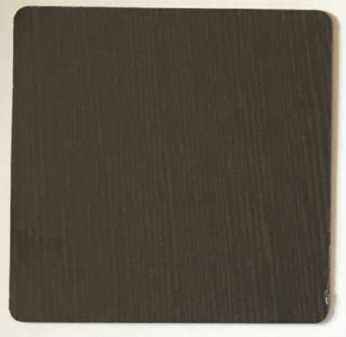
7019 Flowery Wenge