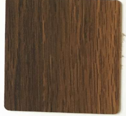
7033 Dark Oak