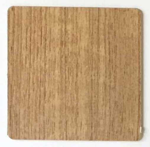
7024 Elegant Teak