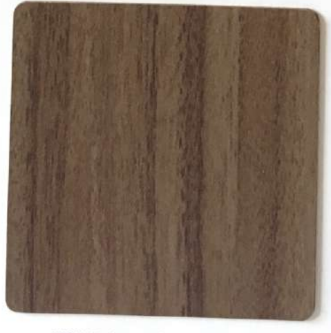
7023 Lorraine Walnut