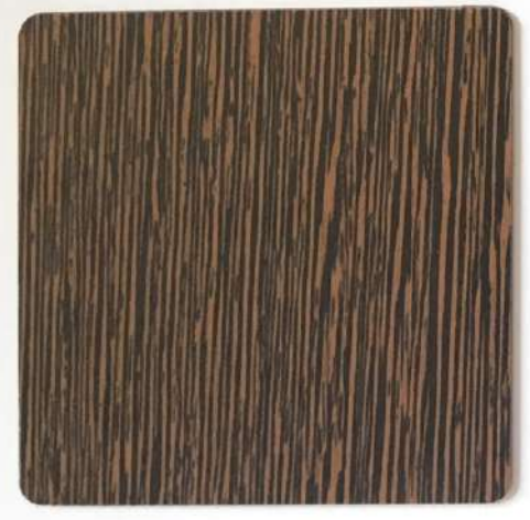
7022 Straight Wenge