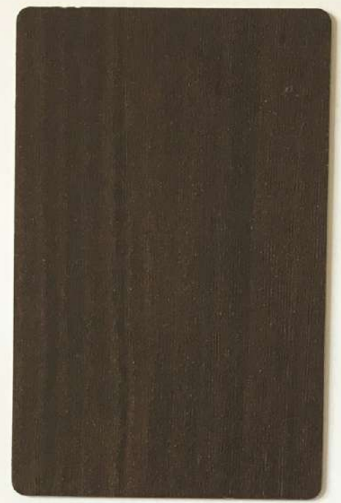
7017 Moldau Acacia Dark