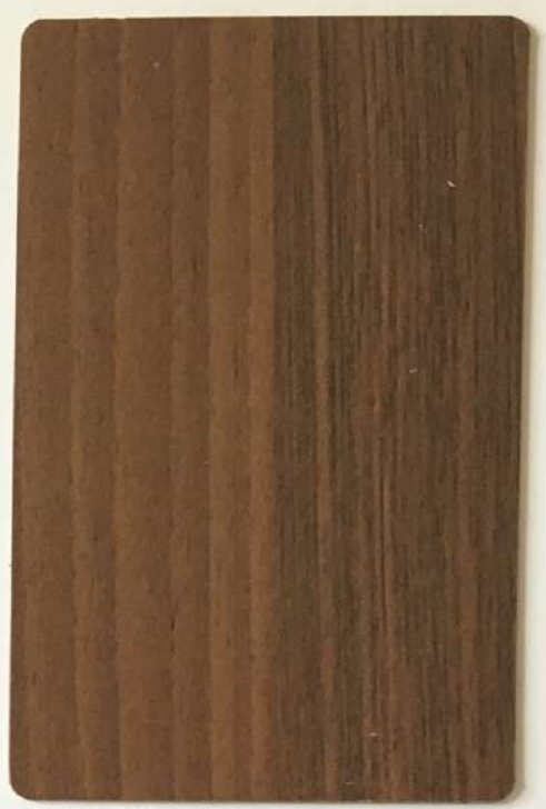
7018 Classic Planed Walnut