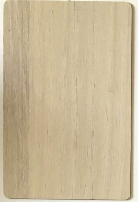
7016 Moldau Acacia Light